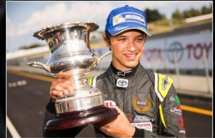
Lando Norris – McLaren F1

The TRS Rookie of the Year Trophy will be awarded to the rookie driver gaining the highest aggregate points overall from all five rounds constituting the championship.